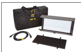
Diva-Lite 20 LED DMX Kit w/ Soft Case