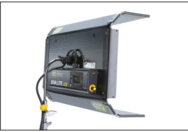
Mounted on a baby stand.