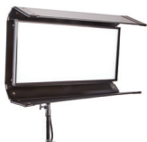
Diva-Lite 20 LED DMX