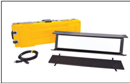
Diva-Lite 30 LED DMX Kit w/ Flight Case