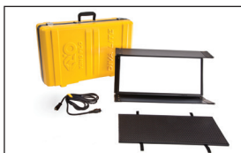
Diva-Lite 20 LED DMX Kit