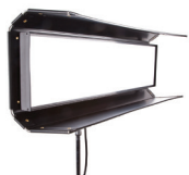
Diva-Lite 30 LED DMX