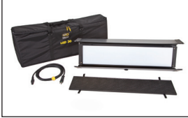
Diva-Lite 30 LED DMX Kit w/ Soft Case