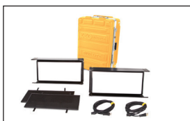
Diva-Lite 20 LED DMX Kit (2-Unit) w/ Flight Case