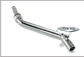
MTP-B41F Kino Offset w/ Baby Receiver (16mm)