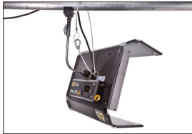
Mounted to pipe grid.