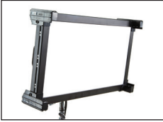
CEL-250C Celeb 250 LED DMX Center Mount

AC Input Voltage: 100~240VAC 50/60Hz, 145W Amperage VAC: 1.2A at 120VAC, 0.7A at 230VAC DC Input Voltage: 18~36VDC, 150W Amperage VDC: 6.25A at 24VDC Kelvin Range: 2700K~6500K (White Mode) 2500K~9900K (Color Mode) Dimming Range: 100%~1% Weight: 15 lb (6.8kg) Dimensions: 24 x 5 x 14" (61 x 12.7 x 35.5cm)