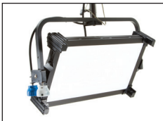
CEL-250P Celeb 250 LED DMX Pole-Op

AC Input Voltage: 100~240VAC 50/60Hz, 145W Amperage VAC: 1.2A at 120VAC, 0.7A at 230VAC DC Input Voltage: 18~36VDC, 150W Amperage VDC: 6.25A at 24VDC Kelvin Range: 2700K~6500K (White Mode) 2500K~9900K (Color Mode) Dimming Range: 100%~1% Weight: 16 lb (7.3kg) Dimensions: 28.5 x 5 x 16.5" (72.3 x 12.7 x 42cm)