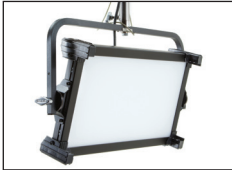
CEL-250Y Celeb 250 LED DMX Yoke Mount

AC Input Voltage: 100~240VAC 50/60Hz, 145W Amperage VAC: 1.2A at 120VAC, 0.7A at 230VAC DC Input Voltage: 18~36VDC, 150W Amperage VDC: 6.25A at 24VDC Kelvin Range: 2700K~6500K (White Mode) 2500K~9900K (Color Mode) Dimming Range: 100%~1% Weight: 15 lb (6.8kg) Dimensions: 24 x 5 x 14" (61 x 12.7 x 35.5cm)